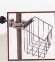
Basket Adapter #741332 24.50