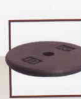
Base Weight #350036 16.00