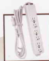
Power Strip #350030 138.75

Omnimed stands can be customized with accessories to enhance your mobile computing experience.