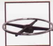
Wheel Ring Handle #350051 49.25