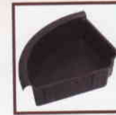
Poly Tray #350055 12.75