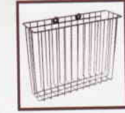
Transport Basket #350002 10H x 13W x 4D • 45.00