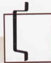
Cord Wrap #350033 27.50