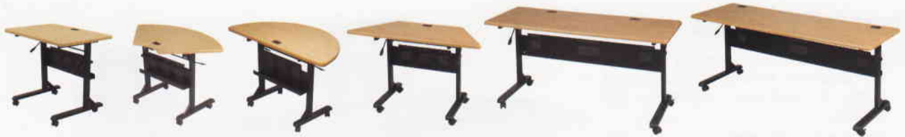
36"W x 24"D