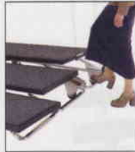
Gas-Spring Lift Assist