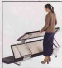
Simple Unitized Design